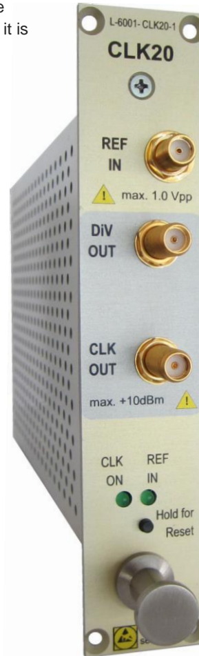
CLOCK SOURCE MODULE p/n L-6001-CLK20-2